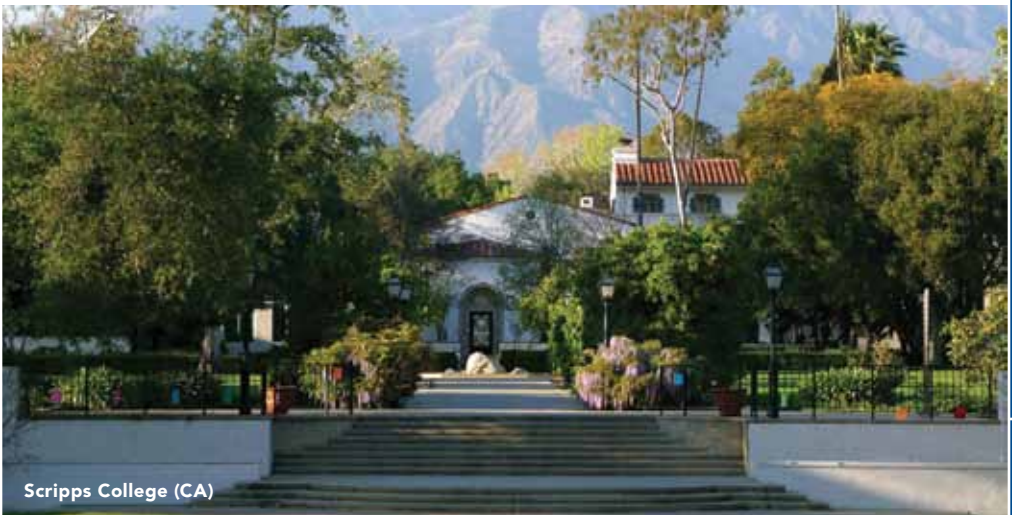
Scripps College (CA)