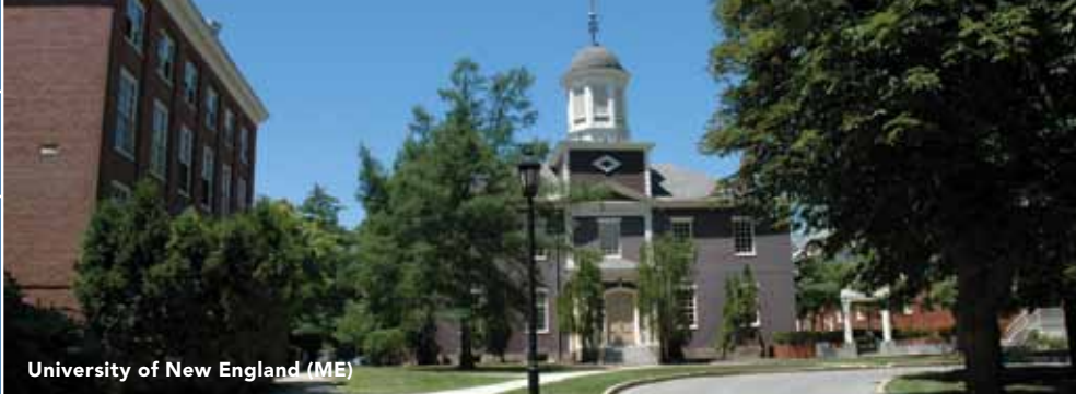
University of New England (ME)