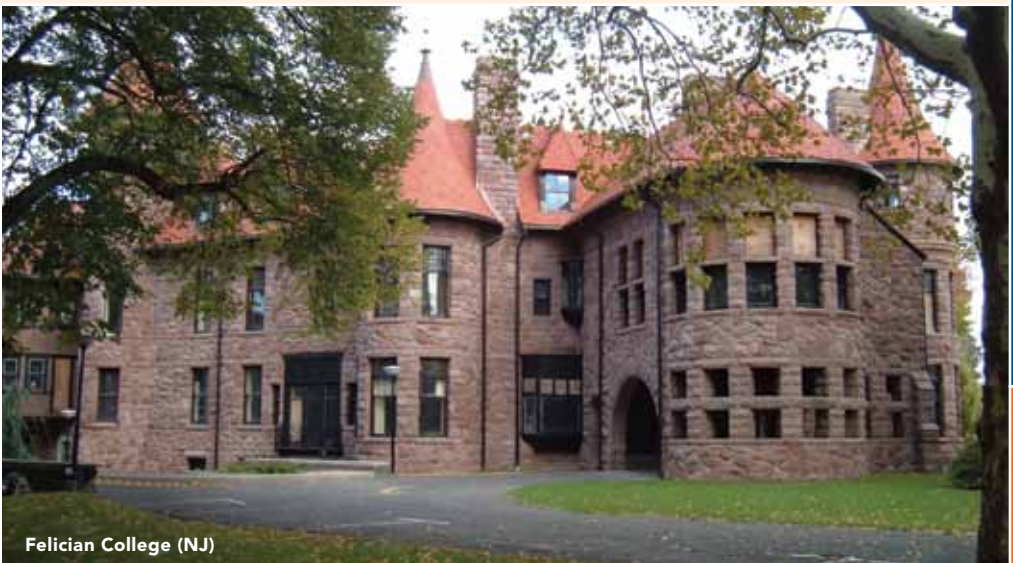
Felician College (NJ)